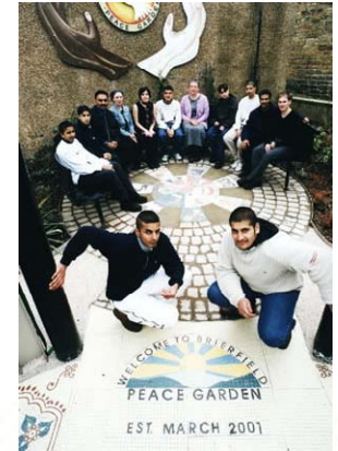
"The garden has played a role in helping to calm the violence down round here."