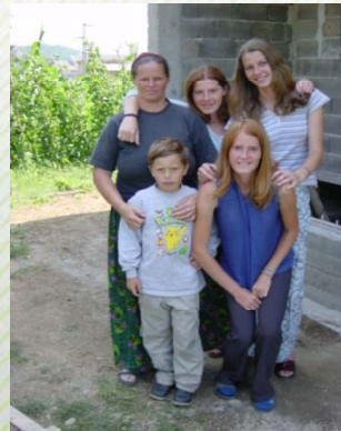
"...My garden is the only place where I (am) leaving behind war and memories..."