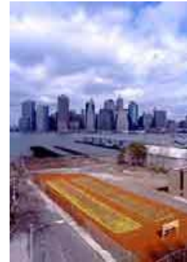
Photo of girl with dust mask drawing flower near Ground Zero, September 13, 2001... and the Brooklyn Promenade with twin daffodil flower beds the following Spring.