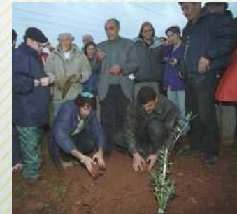
"... the Torah itself declares, "Even if you are at war with a city . . . you must not destroy its trees." (Deut 20: 19-20)